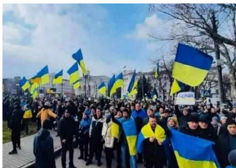
Photos 8 and 9. The content of Ukrainian publications and social networks with the skeptical signature of the “liberators”

Today, photo content of communication platforms is becoming part of the strategic communication of authorities with the population of the country due to its specificity of being quickly displayed and uploaded to information carriers. Ukraine is under constant shelling and missile strikes from the territories of the Russian Federation and Belarus. It is not surprising that there are interruptions in communication, because the enemy systematically tries to target the objects of the state's critical information structure. Power outages and Internet outages can contribute to Russia's desire to drive the country's population into an information vacuum. This policy has been practiced by the occupiers in the temporarily occupied territories. It is because of that the desire of the state and journalists to keep the correct and truthful vector of information is important. Of all multimedia components of modern content, photography weighs the least and therefore opens