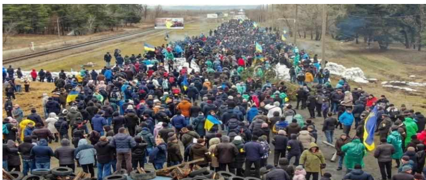
Photo 7.