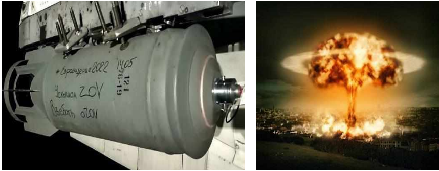
Photos 1 and 2. Photos from telegrams of the “Ukraine online” channel

The photos show a rocket that, after Eurovision 2022 and the call of the Kalush Orchestra band “Save Azovstal”, the Russian army launched at the Azovstal plant, where many the civilian population of the city of Mariupol were in shelters. The photo on the right shows a nuclear explosion, which Russia constantly threatens Ukraine with.