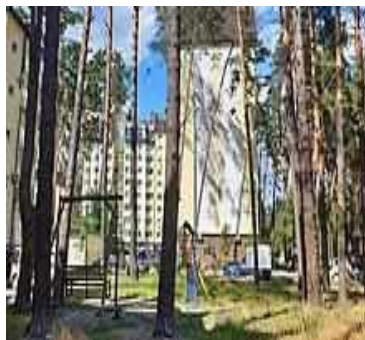
Photos 5 and 6.